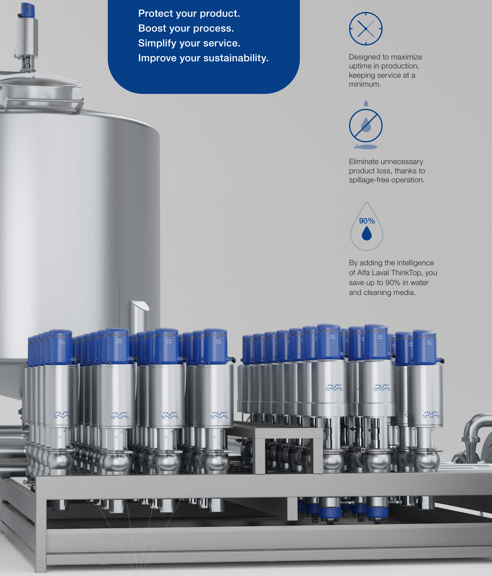
Unique Mixproof Process

By adding the intelligence of Alfa Laval ThinkTop, you save up to 90% in water and cleaning media.