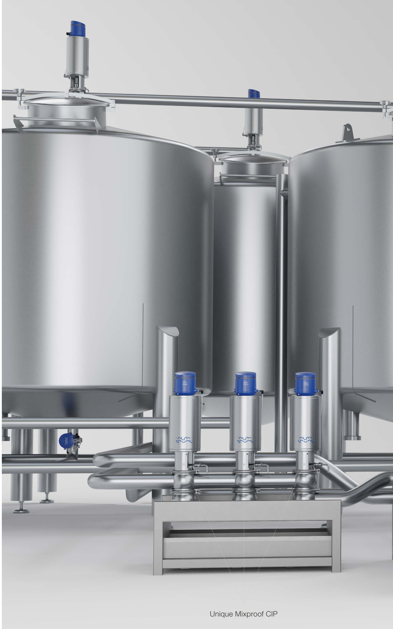
Unique Mixproof CIP